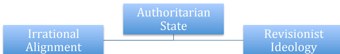
Figure 2. Alternative Hypothesis 1 for Alignment Determinants in Syria

The first alternative hypothesis states that authoritarian states do not have a rational foreign policy, one that is capable of maximizing utility and minimizing costs, due subordinating foreign policy for regime survival. To compensate for lack of legitimacy domestically, authoritarian rulers utilize foreign policy as a focal point to divert the public's attention from internal economic, social and political crisis. Hence foreign policy does not serve national interests, and is then by definition irrational. This hypothesis focuses on ideology as the motivator for foreign policy in authoritarian states.